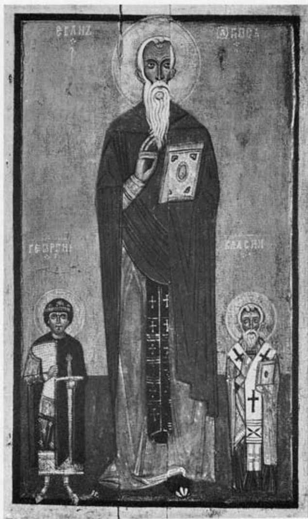
8. SAINT JOHN BETWEEN SAINTS GEORGE AND BLAISE