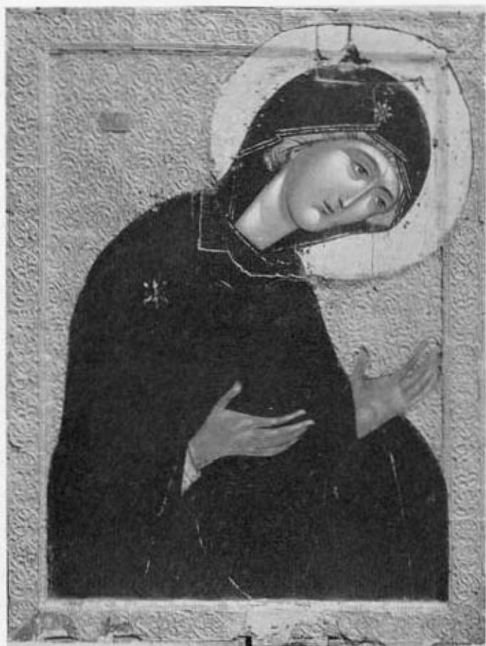
17. THE VIRGIN (DEESIS TYPE)