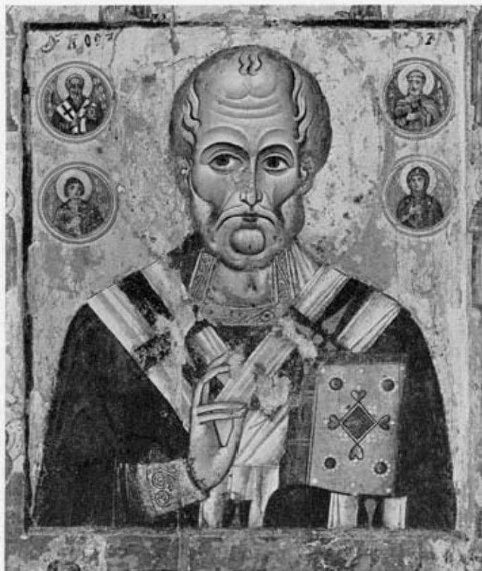
6. SAINT NICHOLAS, BISHOP OF MYRA