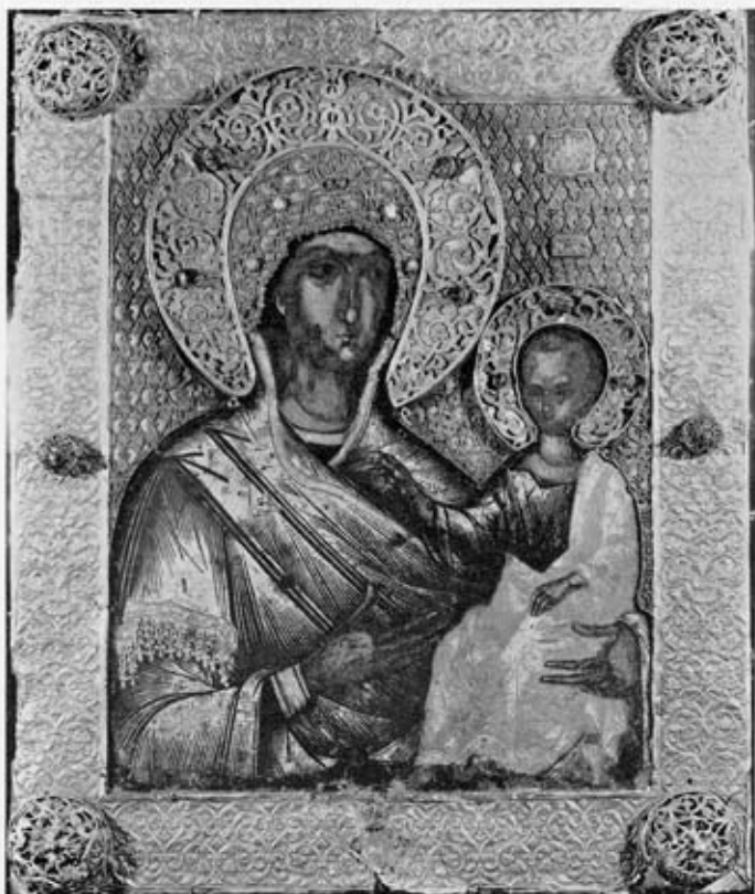
48. THE VIRGIN AND CHILD