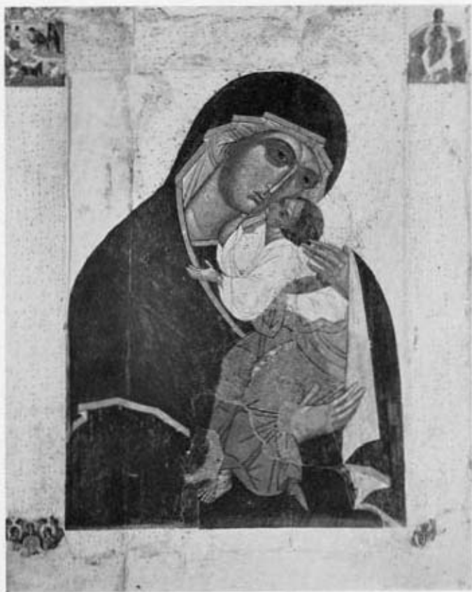
25. VIRGIN AND CHILD