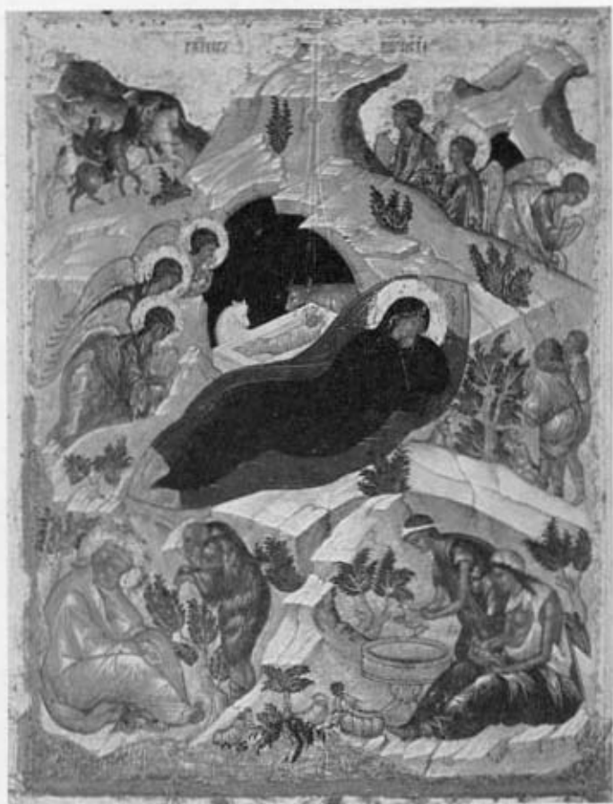
38. THE NATIVITY