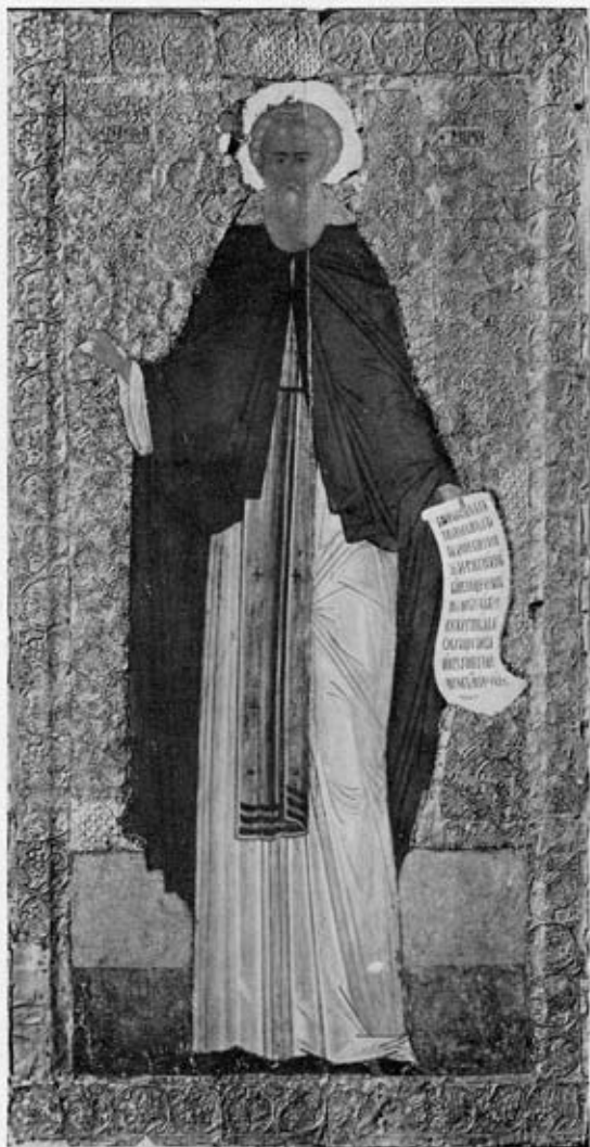
55. SAINT CYRIL OF BELO-OZERO