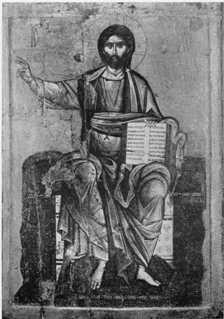
50. THE REDEEMER ENTHRONED