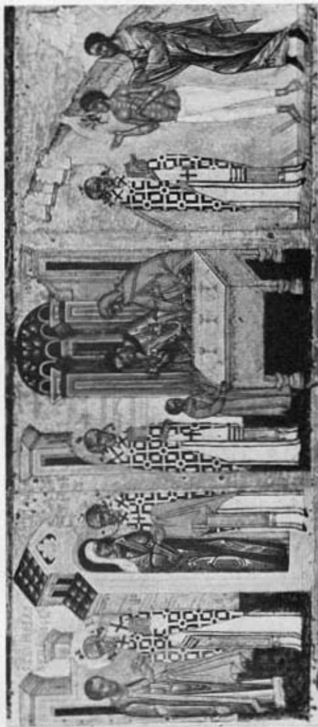
53. SAINT NICHOLAS, BISHOP OF MYRA (DETAIL)