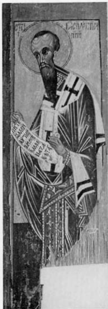
9. SAINT BASIL THE GREAT BISHOP OF CAESAREA