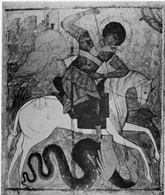
89. SAINT GEORGE AND THE DRAGON