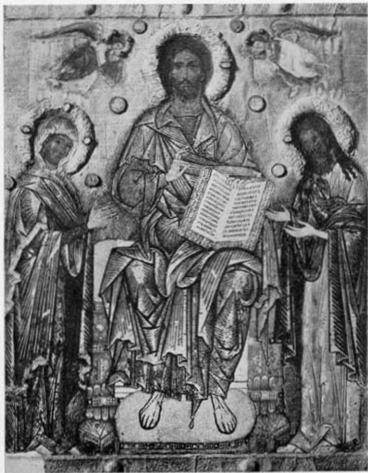
7. DEESIS: CHRIST BETWEEN THE VIRGIN AND SAINT JOHN THE BAPTIST