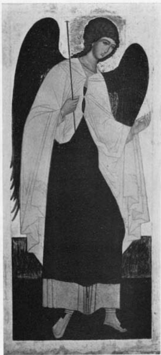
58. THE ARCHANGEL MICHAEL