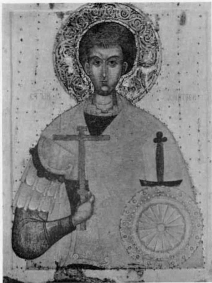
49. SAINT DEMETRIUS OF THESSALONICA