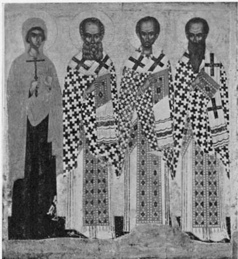
10. SAINTS PARASCEVA, GREGORY THE THEOLOGIAN JOHN CHRYSOSTOM, AND BASIL THE GREAT