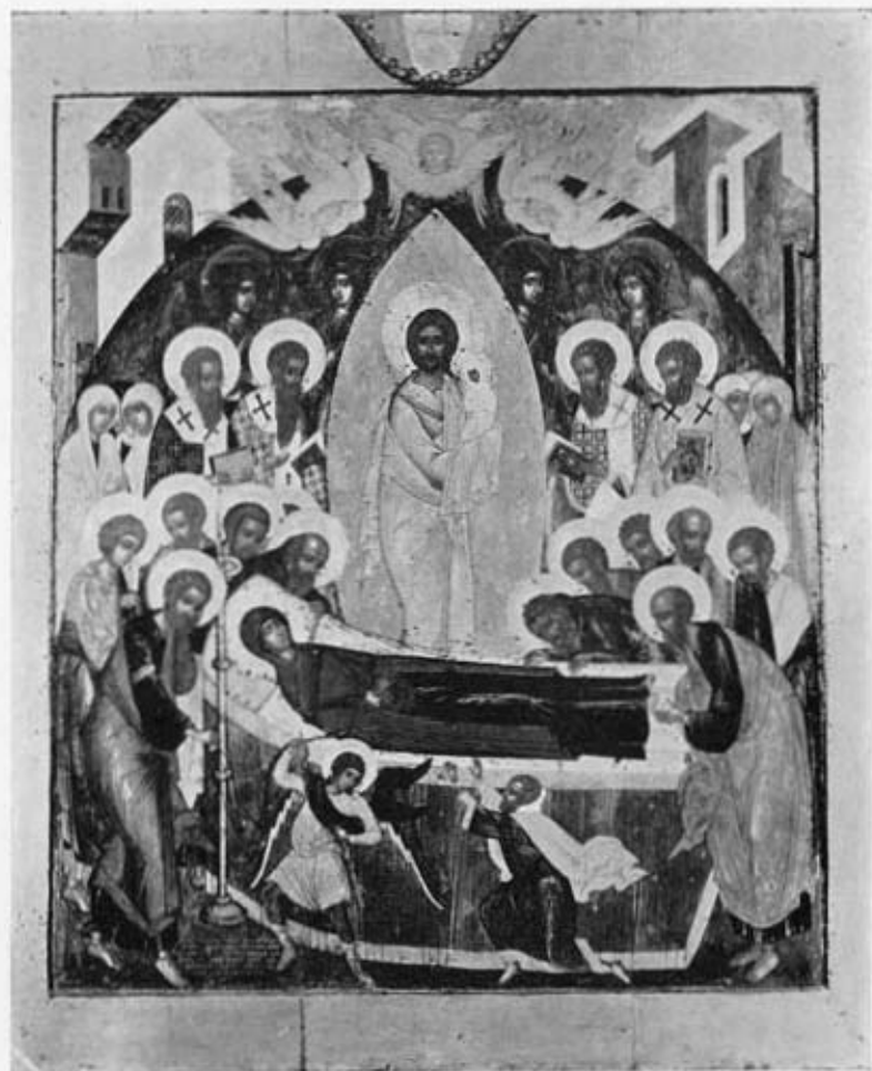
113. THE DORMITION OF THE VIRGIN