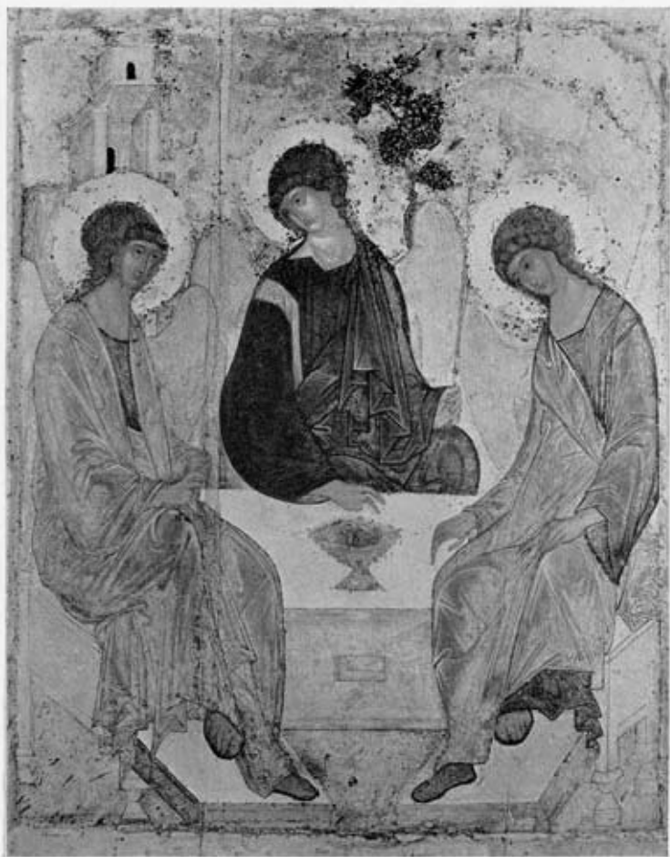
19. THE OLD TESTAMENT TRINITY (COPY)