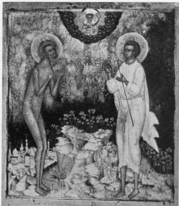
92. SAINTS VASILI BLAZHENNY AND ARTEMIUS OF VERKOLY