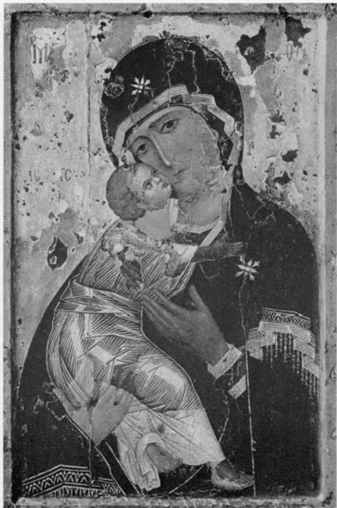
1. THE VIRGIN OF VLADIMIR (COPY)