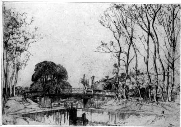
LOCK AT MORET Katharine Kimball