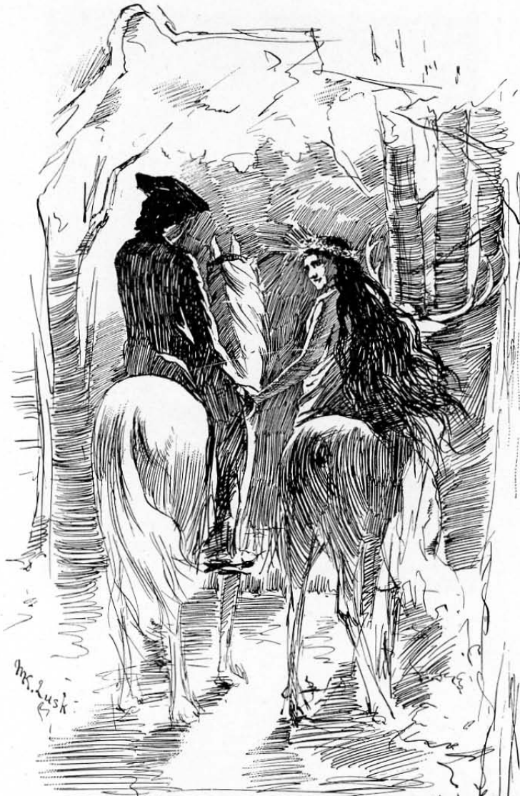
— The Wood-nymph — Eve of Saint John —