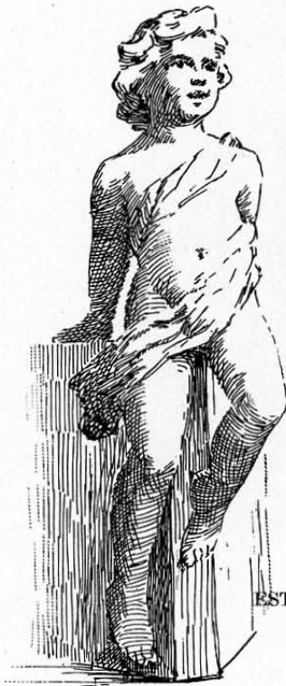
DESIGN FOR PROW OF BOAT. BESSIE O. POTTER.