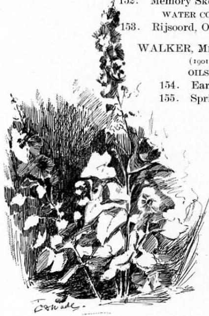
YELLOW HOLLYHOCKS. C. D. WADE.