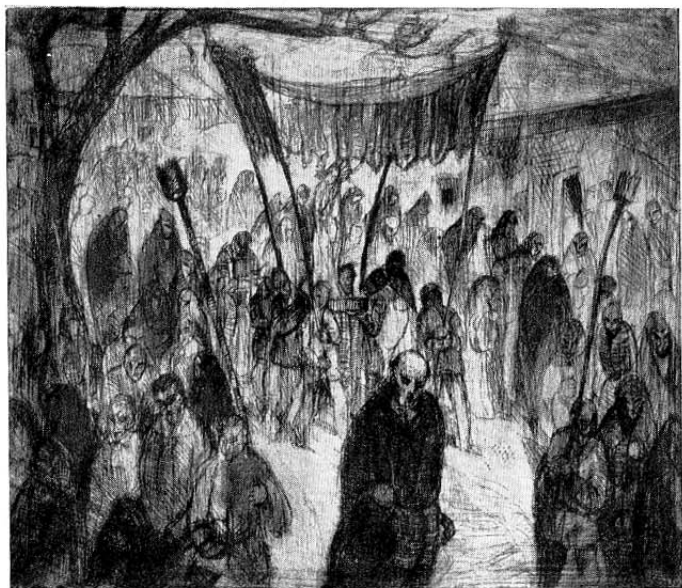
PROCESSION OF ST. FRANCIS, SANTA FE, N. M.