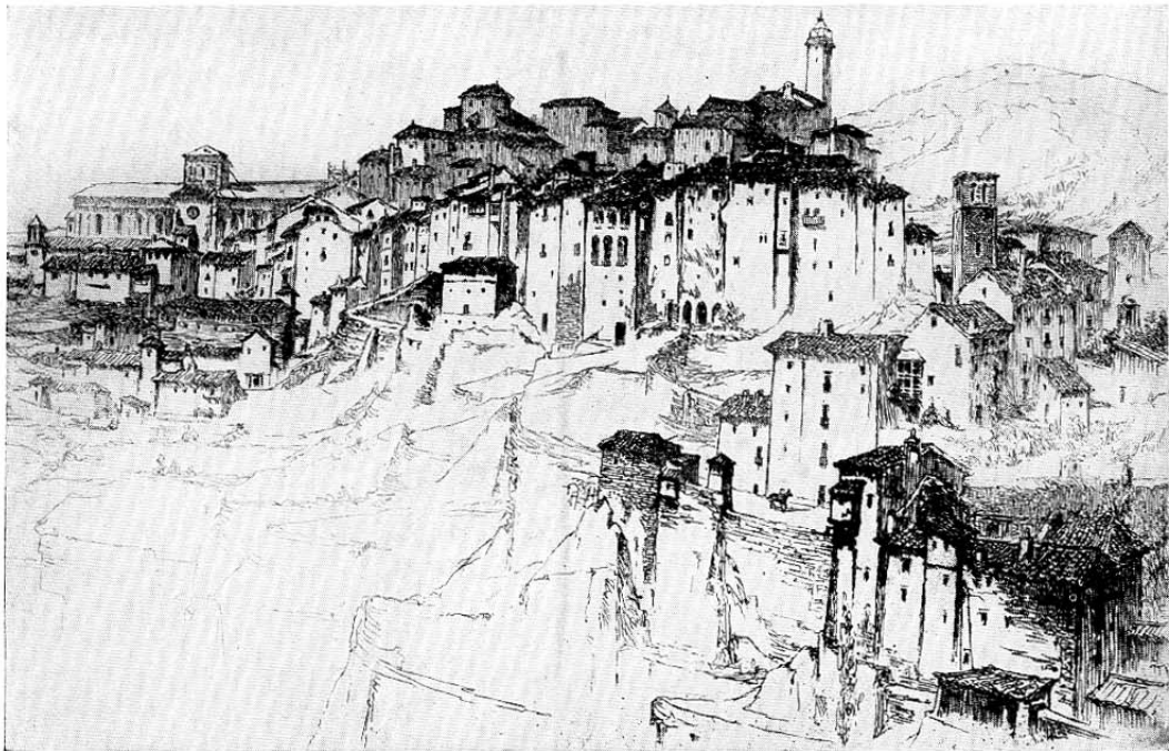
CUENCA, FROM ACROSS THE HUSCAR