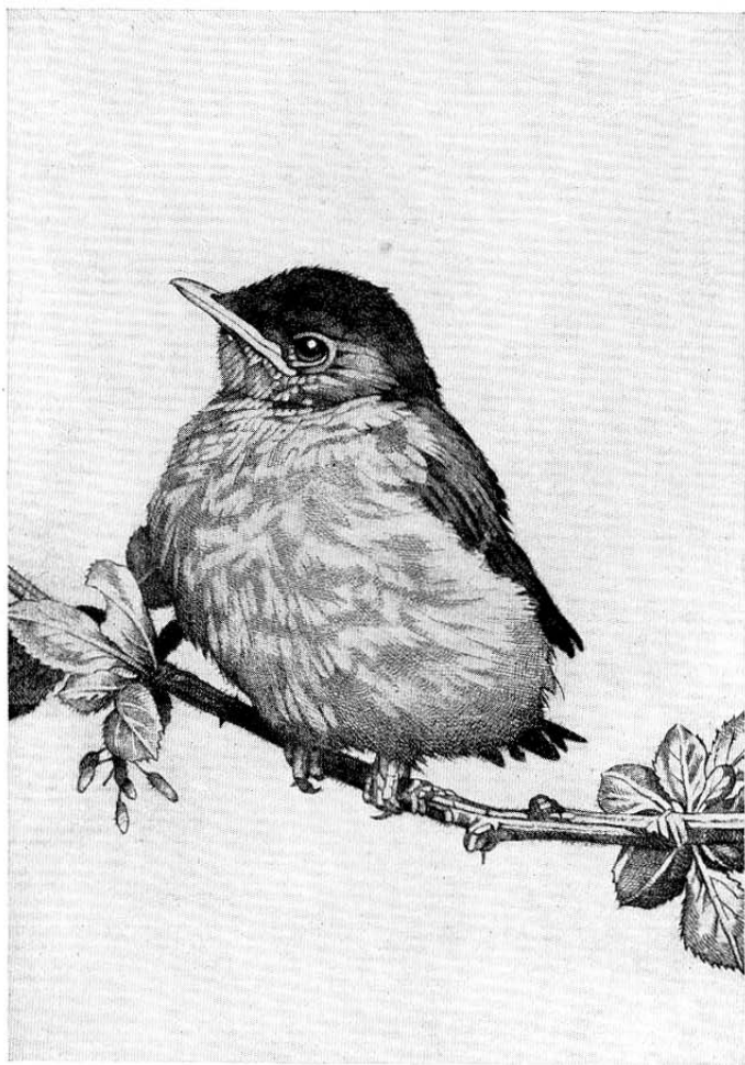
YOUNG CATBIRD